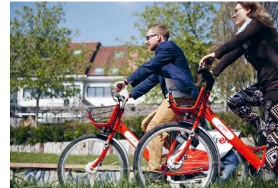
Travel freely through the city: reach any destination by individual routes

The particular strength of the VAG mobile app is its ability to access the services of both providers in the multimodal transport system, and to link these services to one another. In this way, users can quickly, securely and conveniently select their preferred transport route at any time.