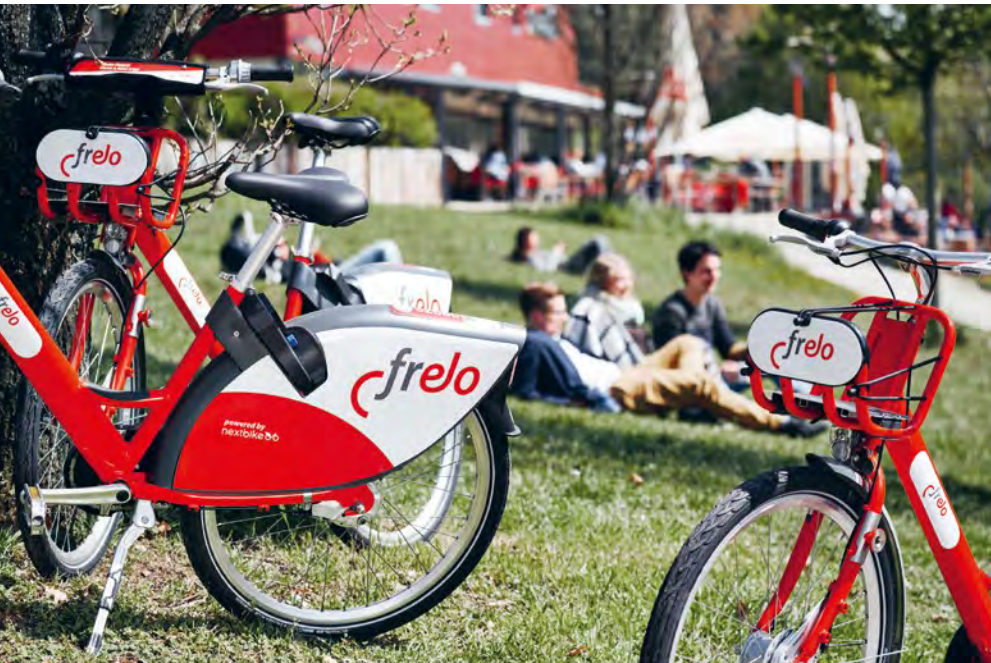
Convenience for the daily commute: rental bikes get people moving and lets them enjoy a city in a whole new way.